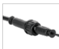
IP67 Interconnecting plug

(L) 82mm Length (W) 46mm Width (H) 29mm Height