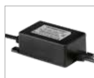
IP67 Driver plug