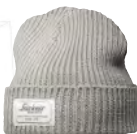
9093 WINDSTOPPER® Beanie Page: 122